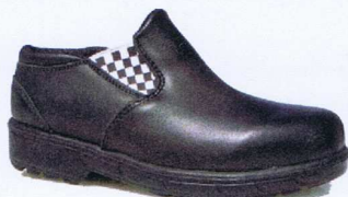
318 Chef Clog CUSHIONED

Upper: Full grain black leather. Lining: Moisture wicking Vtex. Closure: Double stitched elastic panels. Footbed: Flexi-Dome. Sole: Slip resistant Endura air cushion. Sizes: Men's 2, 3 - 1/2 - 11, 12.