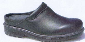
327 Ryde Open back Clog CUSHIONED

Upper: Full grain black waxy leather Closure: Double stitched elastic panels. Footbed: Flexi - Dome. Sole: Slip resistant Endura air cushion. Sizes: Men's: 3 - 1/2 - 12, 13, 14.