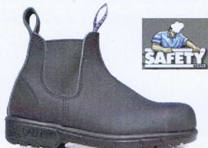
701 Apollo - Safety CUSHIONED

Upper: Full grain black leather. Lining: Moisture wicking Vtex. Footbed: Flexi - Dome. Sole: Slip resistant Endura air cushion. Sizes: Men's: 2, 3 - 1/2 - 11, 12.