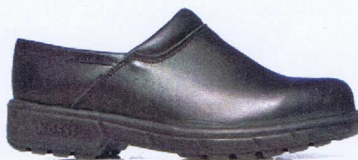
324 Regency Clog CUSHIONED

Upper: Full grain black leather. Lining: Moisture wicking Vtex. Closure: Black & White chequered elastic. Footbed: Flexi-Dome. Sole: Slip resistant Endura air cushion. Sizes: Men's: 2, 3 - 1/2 - 11, 12, 13, 14.