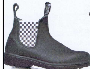
317 Chef Boot CUSHIONED

Upper: Full grain black leather. Closure: Double stitched elastic panels. Footbed: Polyurethane contoured comfort. Sole: Slip resistant Endura air cushion. Sizes: Men's: 2, 3 - 1/2 - 12, 13, 14, 15.