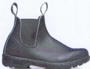
301 Endura CUSHIONED

www.justshearing.com.au EUDUNDA SHOP 13 Bruce Street, Eudunda Phone/Fax: 08 8581 1951 Mobile: 0429 811 541 Mobile: 0427 337 843