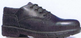
351 Chef CUSHIONED

Upper: Full grain black leather. Closure: Black & White chequered elastic. Footbed: Polyurethane contoured comfort. Sole: Slip resistant Endura air cushion. Sizes: Men's: 4 - 1/2 - 12.