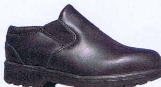
321 Hornet CUSHIONED

Upper: Full grain black leather. Lining: Moisture wicking Vtex. Closure: Rust proof eyelets. Footbed: Flexi - Dome. Sole: Slip resistant Endura air cushion. Size: Men's: 3, 4 - 1/2 - 12, 13.